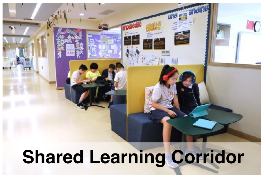
Shared Learning Corridor